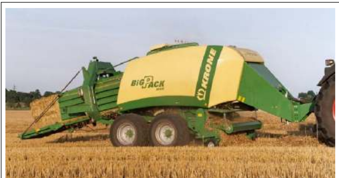
Figure 13: Krone Corporation Big Pack 1290 High Density Press Baler

Both Nott farms and Foley farms believe it is easier to get a higher bale density using the 3'x3' bales than the 3x 4' bales. Krone Corporation has introduced a "Big Pack" 1290 High Density Press large scale press to the market which produces 90cm x120 bales using a pre-chopper device that pre-compresses material as well as a higher-than-normal compression bale chamber (Figure 13). These two features increase bale density by 20-25% compared to their standard large square baler. The company indicates that if material on an as-is basis is baled with their 1290 High Density Press baler they could increase bale density to 200-220 kg/m 3 (or 170-187 dry kg/m 3 ) versus the normal 160-180 kg/m 3 range achieved with their traditional large bale technology. This is within the range predicted by Nott farms for switchgrass harvest with a pre-chop system in their 32" x 34" baler.