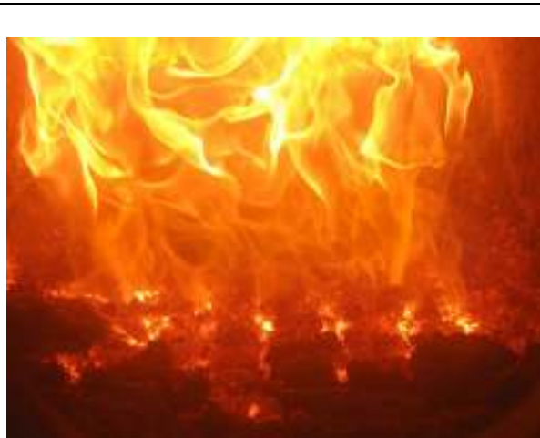
Figure 20: Combustion of pellets in the 1MW grate furnace

Initial results are presented below for the differences between spring and fall harvested switchgrass (Table 7.1). Some advantages appear to be present with regard to ppm emissions of NO x , S and CO emissions with the spring harvested grass. Further analytical data is forthcoming from the CANMET Combustion lab which will enable a more complete comparison of the pellets produced from the two harvest periods and their impact on combustion efficiency and ambient air quality. Details of the findings to date are provided in Appendix I in this report.