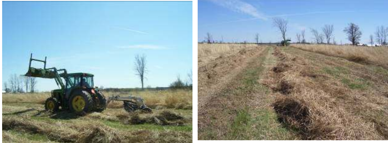
Figure 5: Raking operations on fall mown plots. Note trampling of windrows with tractor tires.

Both tramping of the tires while passing over the windrows and lack of effective recovery of the windrows with the baler pickup were considered problems. To correct for this, the material was subsequently raked with a side rake before baling. However, this raking process still caused some tramping of biomass when the tractor tires ran over some of the fall mown windrows (Figure 5). In the spring mowed plots, only a mowing operation was used as the windrows were sufficiently uniform to enable the baler to pass over them without the need for raking.