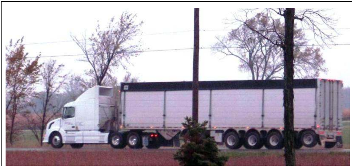
Figure 17: The 97.9 m 3 Titan van used by Nott Farms for bulk biomass hauling

Conventional wisdom amongst biomass scientists was that bulk biomass handling was inefficient compared to baled biomass. However this assessment indicates up to 62% higher loads could be carried with switchgrass in a fine ground state suitable for densification applications compared to transport of conventional switchgrass bales in a large transport van. The advantage will be highly dependent on the chop size that is transported as research has shown that chop size has a major influence on chop bulk density (Kaliyan and Morey 2006; Mani et al. , 2004). If the BIG X 650 does not adequately reduce the chop to the equivalent of a 3mm screen size hammermill grind it may require a second fine grind to provide a high transport load as found in Table 5.1. Otherwise lower load weights similar to bales may be realized. Future studies are required that measure actual loads carried in transport vans with switchgrass of various grinds. The data sourced from this analysis are further developed into an economic analysis in section 6 to identify efficient strategies to reduce biomass delivery costs to densification plants.