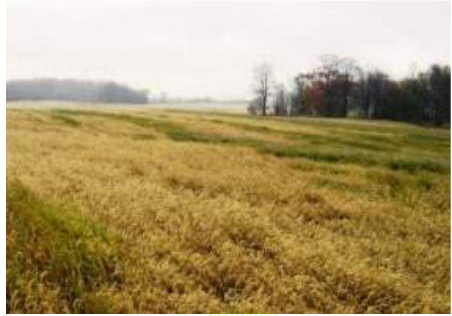
Figure 18: First year switchgrass on Site B1 in Bruce County (L) and B2 in Huron County (R)