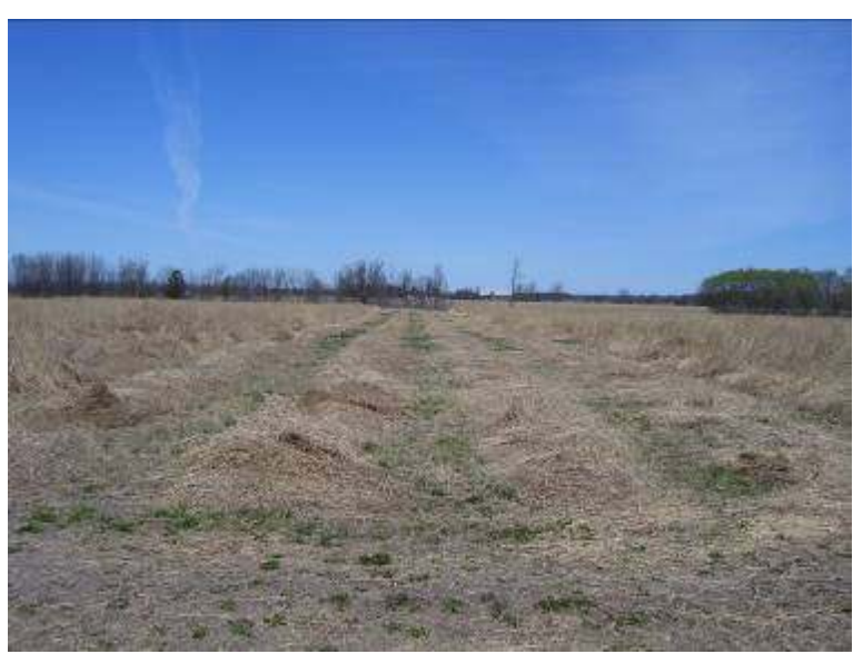
Figure 10: Windrows prior to raking on fall mown plots

not be set very low because the farmer operator was required to travel across the dead furrows because of the plot layout on the field. This caused some residual material to be left in the field, particularly in the dead furrow areas. As well, there were a few sections in the trial area where the fall mown windrows were quite thick and had larger accumulations of material. Tramping by tractor tires of the fall mown windrows