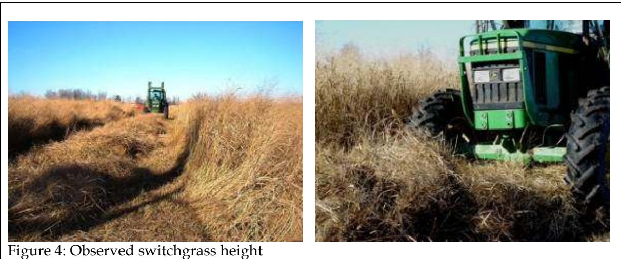
Figure 4: Observed switchgrass height

In the fall of 2006, the switchgrass averaged about 1.7 m in height (Figure 4) and had a fall yield of 10.9 tonnes/ha. As noted above, the soil was too wet to use the baling equipment, and therefore the cut switchgrass was left in windrows to overwinter.