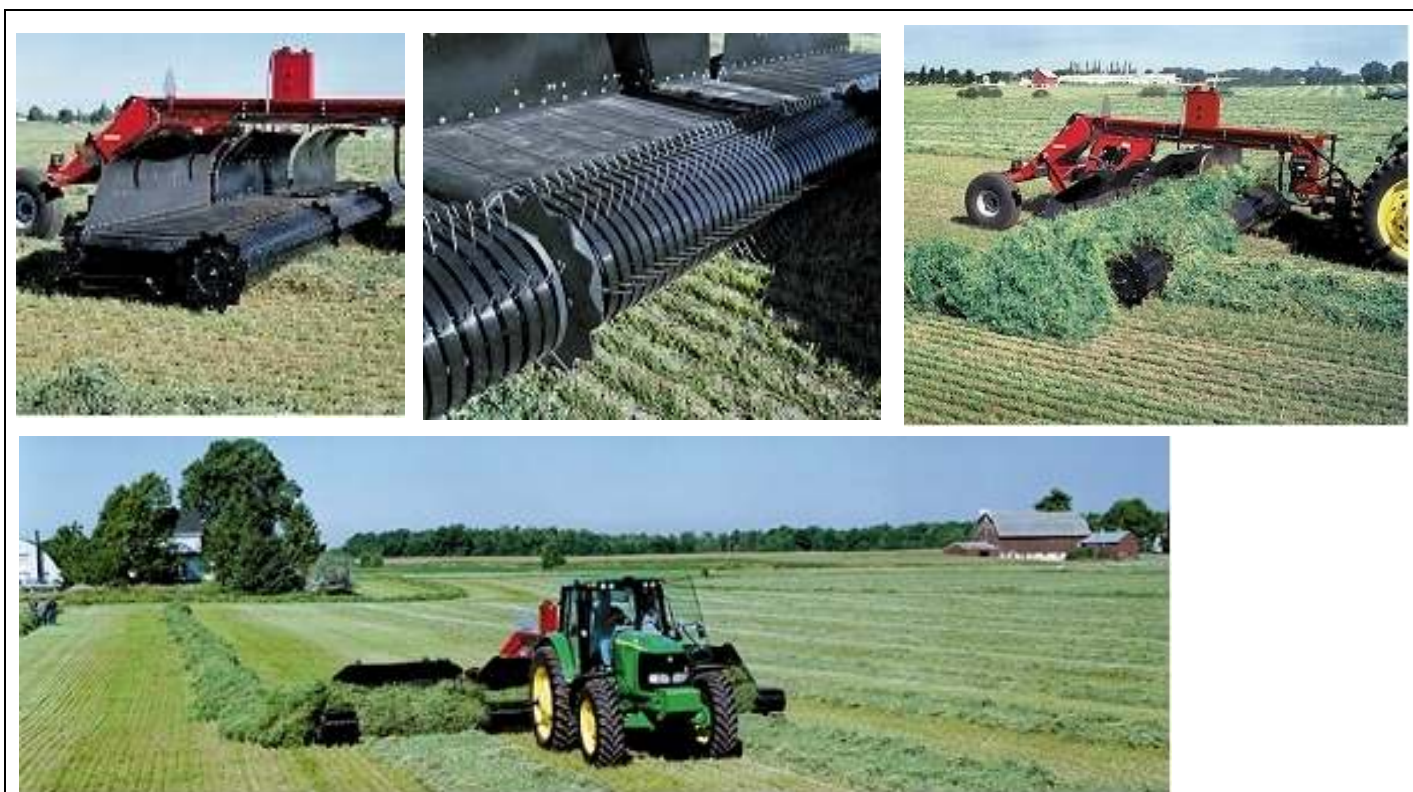
Figure 15: Miller Pro Avalanche 310 Triple Head Power Merger merging hay windrows