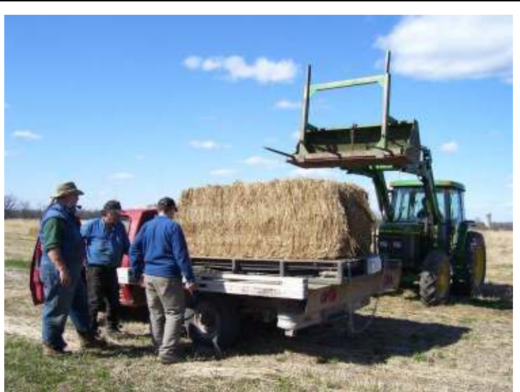
Figure 6: Research team weighing individual bales on pickup truck-mounted digital platform scale

To measure the field harvest weights and the total yield/ha of each system, baling operations were initiated. Baling was done beginning from the south side of each field strip. Once a bale was formed and discharged the baler was stopped, then subsequently backed up a short distance to cause the discharge of the bale. The baler then proceeded to restart from the front of the plot. Two strips were machine harvested from each plot to determine the plots weight. The distance was then measured from the front of the plot to the end of the windrow area that had been harvested in each strip. During field operations, it was noted that the bale dropped at the end of each strip was actually the bale from the previous pass. The large square baler is designed to form a new bale while discharging the previously formed bale. To properly