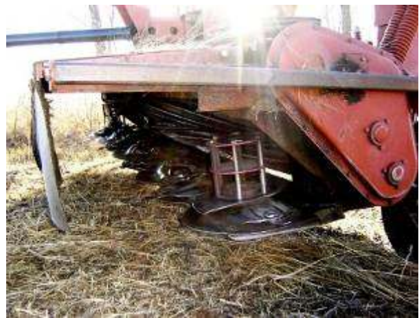
Figure 3: Hesston 1340 pull mower or disc bind