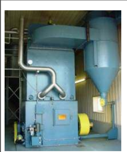
Figure 19: Blue Flame Stoker Combustion Unit

The results found that the fall harvested switchgrass pellets have a calorific value of 18.95 MJ/kg on a dry basis and can be combusted in a grate furnace. The fuel was handled and conveyed into the chamber without major problems. The steady state conditions were 9.6% O 2 and approximately 1000°C. The total particulate emissions were normalized to 7% O 2 and were found to be 117 mg/m 3 , without having gone through any particulate control devices. The majority of volatile organic compounds were not detected. Benzene and chlorobenzene were measured in the largest concentrations at 30.8 and 7.28 ug/m 3 . The total VOCs measured was 55.8 ug/m 3 . The fuel size was consistent and the bulk density was 721 kg/m 3 which is a desirable fuel property. Switchgrass pellets are an ideal biomass fuel because they could be transported economically, they had good combustion characteristics and low emissions. It should be noted that this fuel is highly volatile at 80wt% and therefore the combustor used should have sufficient volume and over-fire air capacity to complete the combustion of the fuel. Otherwise, much higher emissions from incomplete combustion, such as, volatile organic compounds, and carbon monoxide would be expected.