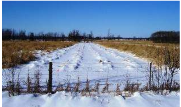
Figure 2: Study Site A replicates 4 and 5: November mowed switchgrass (L); Overwintered switchgrass in January 2007 (R). The snow appears to be preventing losses due to winter wind breakage. The somewhat “wavy” nature of the snow covered windrows can also be observed.

Baling of fall mowed material for Treatment #1 was completed on May 3 rd , 2007. The spring mowed switchgrass in Treatment #2 was left standing in the field for overwintering, to be cut and baled in the spring of 2007. All spring mowed bales were harvested on May 4 th , 2007. A gradient in the field was present in the field due to an uneven N fertilizer application in June 2006. The fertilizer was not evenly broadcast as 60 cm high patches of cool-season grasses were present at the time of fertilization and prevented even spreading in certain locations. The harvest experiment was therefore performed across the gradient which caused some difficulties with machine operations. Each treatment consisted of two passes on November 25, 2006 with the Hesston 12' disc mower conditioner or approximately 7.3 meters (Figure 3). The harvest was performed against the furrows at a speed of 8 km/h (5 mph) at a mowing height of 10.1 cm. Subsequent field measurements indicated the effective operating width of the mower conditioner was determined to be 3.31m.