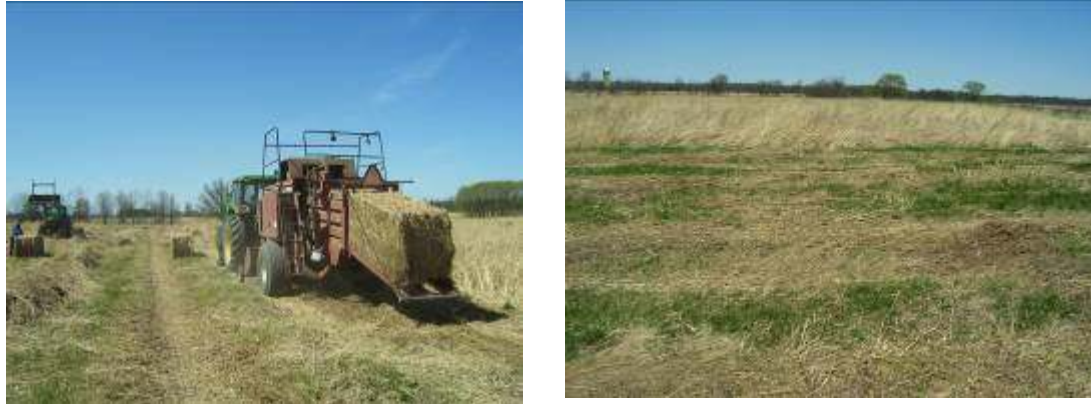
Figure 11: Spring baling of fall mowed plots. Non-uniform losses are created by tramping of biomass during field operations and losses from deadfurrow areas. Unrecovered material is generally not of a fine nature and should be suitable for machine recovery. Also note greening in between rows during spring harvest.

Machine harvest yields from the plot area indicated that the fall mown and spring baled system achieved a 23% higher yield. Recovered field baled yields of 6.6 and 5.4 ODT/ha, for the fall versus spring mown systems, respectively, were found to be statistically significantly different (Table 4.3).