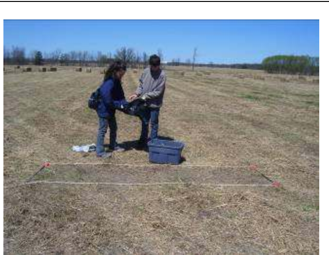
Figure 7: Quadrate sampling of residual biomass after spring field harvest operations.

For the estimates of harvest losses, 3 representative samples from each plot consisting of 2.83 m 2 quadrates each, were taken after the mowing and baling operations had been completed from each replicate in the spring across the harvested strip (Figure 7). These samples were taken on May 4 th , 2007. The quadrate was first raked to collect the residual biomass below 10 cm and then hand gleaned. It should be noted that very fine material such as seeds and small pieces of broken panicles and leaves could not be recovered with this method. The samples were then soaked to remove any collected soil from switchgrass residues and then dried at 55 Degrees C before being weighed.