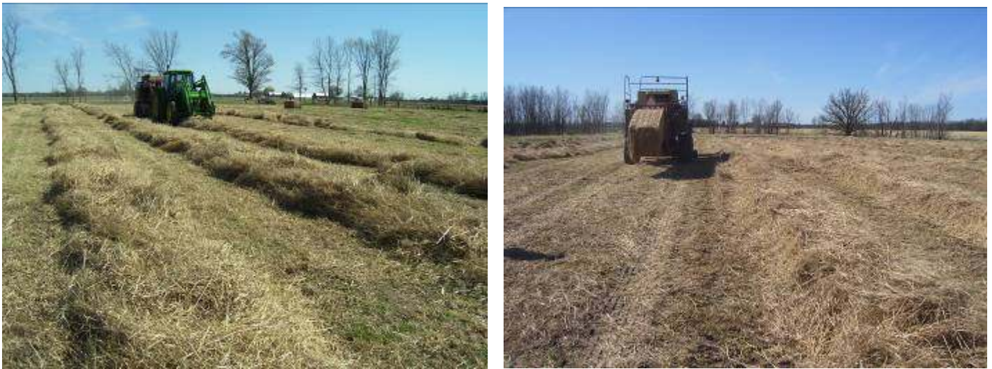
Figure 12: Baling of spring mowed materials. Note that windrows are uniform and contain most cut material. The residual material not recovered by baling is relatively fine and evenly distributed throughout the plot area indicating it is material shattered during mowing or winter breakage.