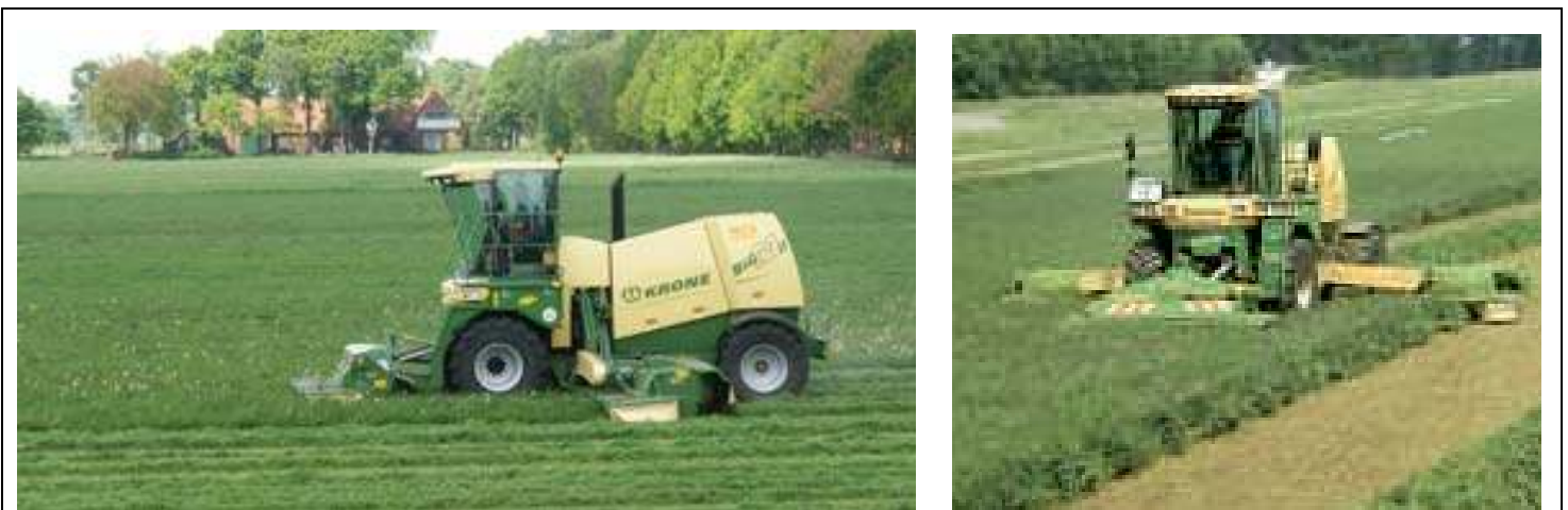
Figure 14: Krone Corporation BIG M 30 Mower Conditioner operating in alfalfa

The system that Nott farm aims to optimize in the future as a means to deliver low cost fibre to a pellet plant to mow the crop using their large 30’ Krone discbine in late fall (Figure 14), then to collect the windrows in the spring using a 30’ Miller pro crop merger (Figure 15). The material then would be fine chopped using the Krone BIG X 650 harvester (Figure 16) and be blown directly into a dump wagon and taken to a covered storage facility.