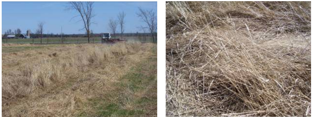
Figure 8: Standing overwintered Cave-in-Rock switchgrass at the time of spring mowing. Note that standing material is highly prone to breakage of seed heads and leaves.

seed (Figure 8). It is likely that the longer days in late winter caused the material to dry out. When late winter and early spring wind storms occurred, the most fragile portions of the plants, namely the seed heads and leaves were broken off. By spring, there were large losses of seed heads and leaves. Plant composition had changed to stems, leaf sheaths, leaves and seed heads comprising 63.7%, 17.9% 13.2% and 5.2% of the plant, respectively.