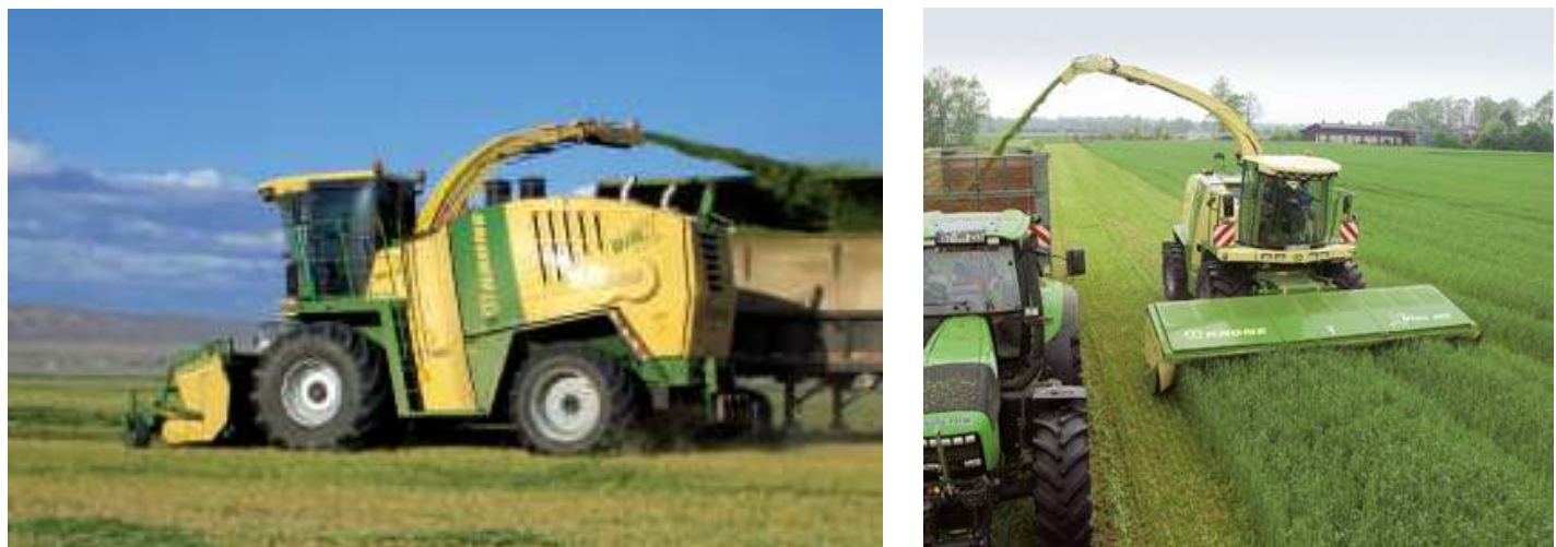
Figure 16: Krone Corporation BIG X 650 Chop Forager harvesting perennial forages

Nott farms estimates the cost of the mowing and crop merging activities at $20/acre ($50/ha) for mowing and $7.50 per acre ($18.75/ha) for the crop merger. Nott farms has no experience with the large Krone BIG X 650 machine for bulk harvesting of forages. As the bulk harvesting study at the Nott farm could not be completed due to difficult field